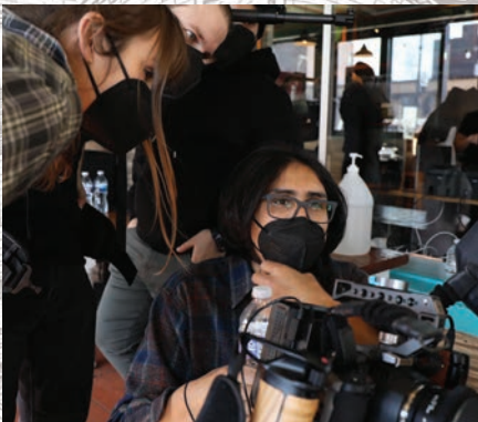
MANNY REEL FILMS